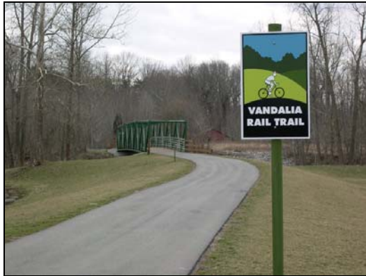
Natural environments in urban & suburban settings

A: The 150-mile cross-state National Road Heritage Trail is a proposed continuous system of multi-use trails built along or near the former Pennsylvania, Vandalia, and electric interurban railway corridors from Terre Haute to Indianapolis to Richmond, closely following the Historic National Road and US 40 for much of its route. This system would connect a number of local trails already being developed by communities across the state, forming a scenic alternate route for pedestrians, bicyclists, and horseback riders separated from motorized traffic.